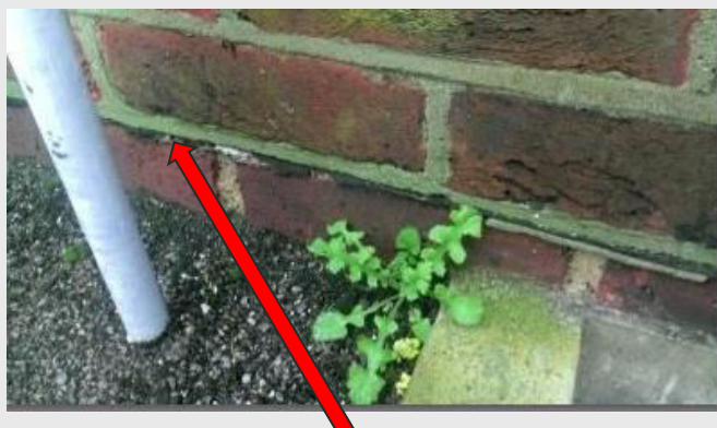
Damp proof membrane